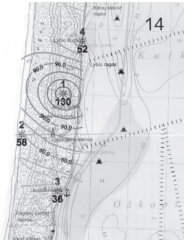
Fig. 2. Sound level measuring points and evaluated sound level during pilot shooting exercises at the Juodkrantė radio locator post.

🔊 58 – the sound level measuring point; above – point number, below – evaluated sound