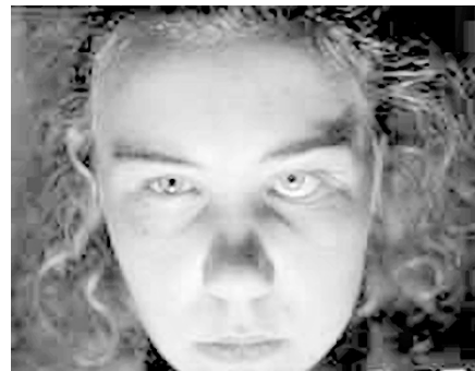
Fig. 2. Patient after an inferior rectus recession and before a lower lid surgery