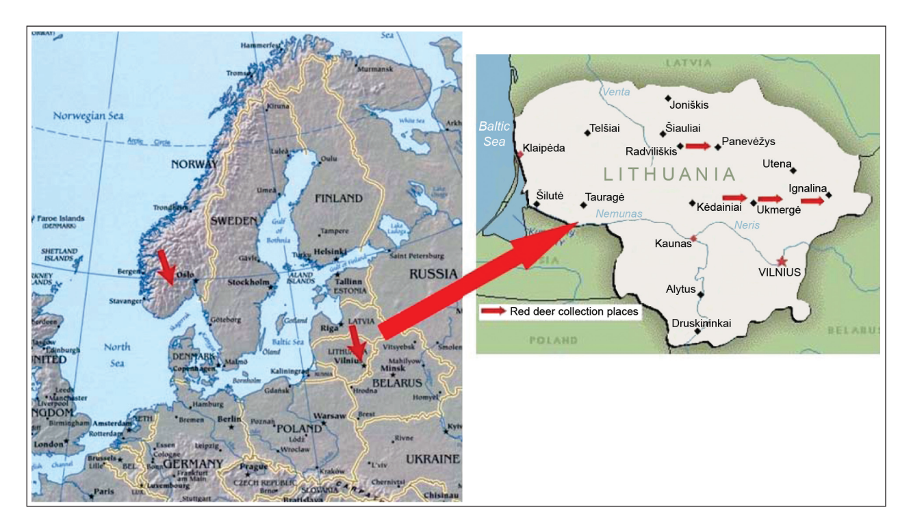
Fig. 1. Sampling localities of Norwegian and Lithuanian red deer

Genomic DNA was extracted from frozen liver and muscles using "Genomic DNA Purification Kit # KO512" (Fermentas, Lithuania), which included lysis, precipitation