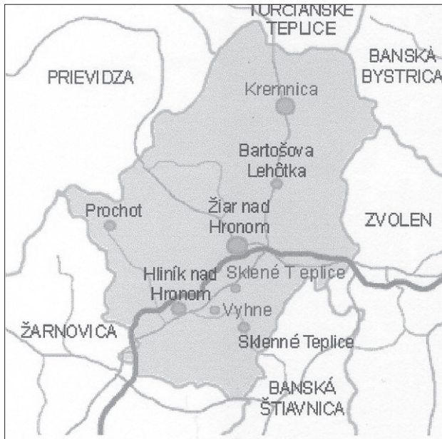
Fig. 1. Itinerary of R. Symonowicz's mineralogical travels; present Slovakia

1 pav. R. Simonavičiaus mineraloginių kelionių maršrutas, dabartinė Slovakija