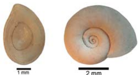
Fig. 4. Representatives of interglacial molluscs in the Netiesos section: on the left – cover of Bithynia tentaculata (Linnaeus), on the right – shell of Gyraulus albus (Müller)

The periglacial freshwater complex of the Netiesos molluscs is less impressive than the terrestrial one. It has no typical periglacial species. According to the shell parameters, it resembles the early interglacial fauna. Gyraulus laevis (Alder) should be recognized as a characteristic species of freshwater fauna in the Netiesos section at the time span discussed. Now it is a holarctic species, whereas in the Pleistocene it was a representative of unstable, mainly periglacial environments, and often appeared in the beginning stage of lake formation. During the transitive phases, the species was distributed in great numbers and was met, as a rule, together with Armiger crista (Linnaeus), Lymnaea peregra (Müller), Valvata piscinalis (Müller) and Sphaerium corneum (Linnaeus). Such a combination of the Netiesos lacustrine fauna is a facies analogue of the forest terrestrial fauna with Columella columella (Martens) and other cryophilic molluscs (cf. Sparks, West, 1968). In Poland, Gyraulus laevis (Alder) is a characteristic representative of loess mollusc associations (Alexandrowicz, 1995).