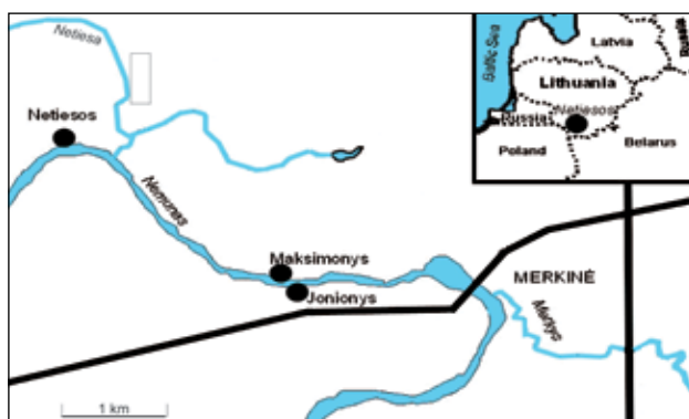
Fig. 1. Location of the investigated Netiesos section. Coordinates (longitude, latitude) – 54 02'20"; 24 05'02"

units, Vilnius, 1999) and are observed on the right bank of the Nemunas River at the Netiesos village, about 1 km downstream of the Netiesa Brook mouth, or 3 km from Jonionys–Maksimony and 6 km westwards of the Merkinė settlement, after which the interglacial and the formation are named. The stratotype section of the Merkinė interglacial explored at the vicinity of Jonionys–Maksimony discloses deposits of a palaeolake on the left side of the Nemunas valley at the Jonionys village and its right side at Maksimony (Fig. 1).