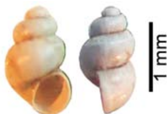
Fig. 3. Belgrandia marginata (Michaud) of the Netiesos section. A view of the shell from the front and from the side 3 pav. Netiesų pjūvis, Belgrandia marginata (Michaud). Geldelės iš priekio ir šono