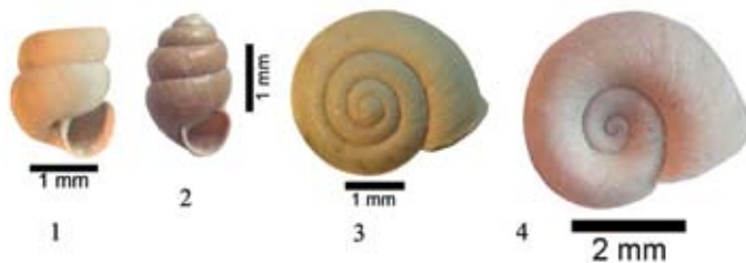
Fig. 5. Representatives of the periglacial molluscs in the Netiesos section. 1 – Columella columella (Martens), 2 – Vertigo genesii (Gredler), 3 – Vallonia tenuilabris (A. Braun), 4 – Gyraulus laevis (Alder)

4 pav. Tarpledynmečio malakofaunos atstovai Netiesų atodangoje. Kairėje pusėje – Bithynia tentaculata (Linnaeus) dangtelis, dešinėje pusėje – Gyraulus albus (Müller) kriauklė