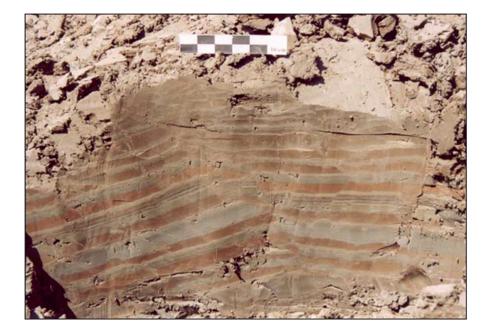
Fig. 2. Varved clay, Mokre, depth 9 m

Fig. 1. Varved clay, Plecewice, depth 6 m