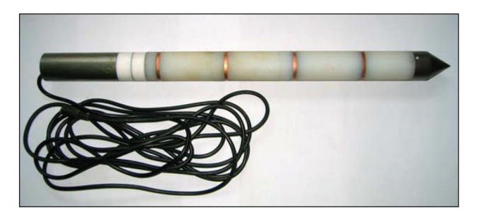
Fig. 5. Prototype geoelectrical probe for electrical soil resistance

mineralization of pore water: a higher mineralization increases conductivity;